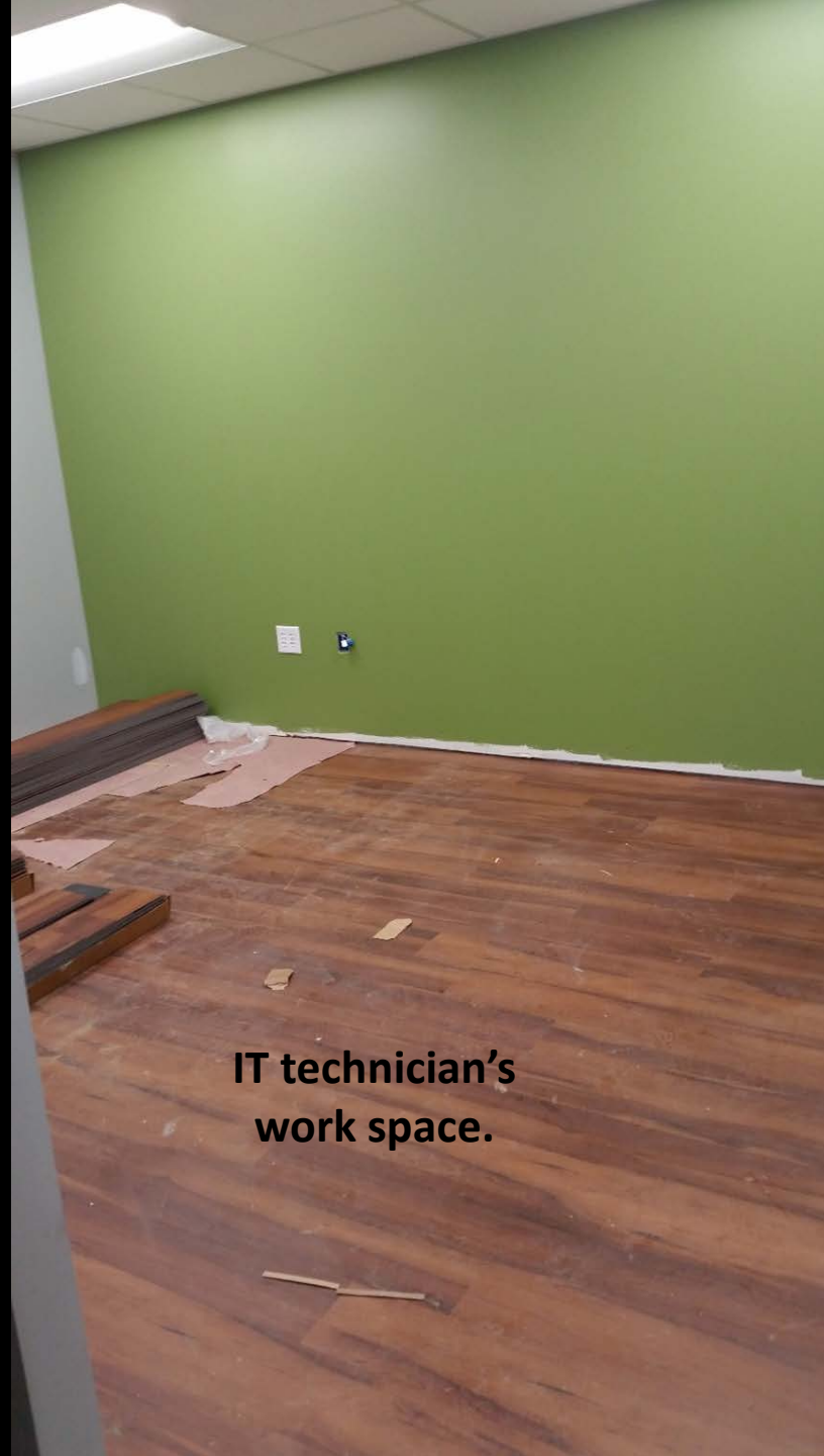
IT technician's work space.